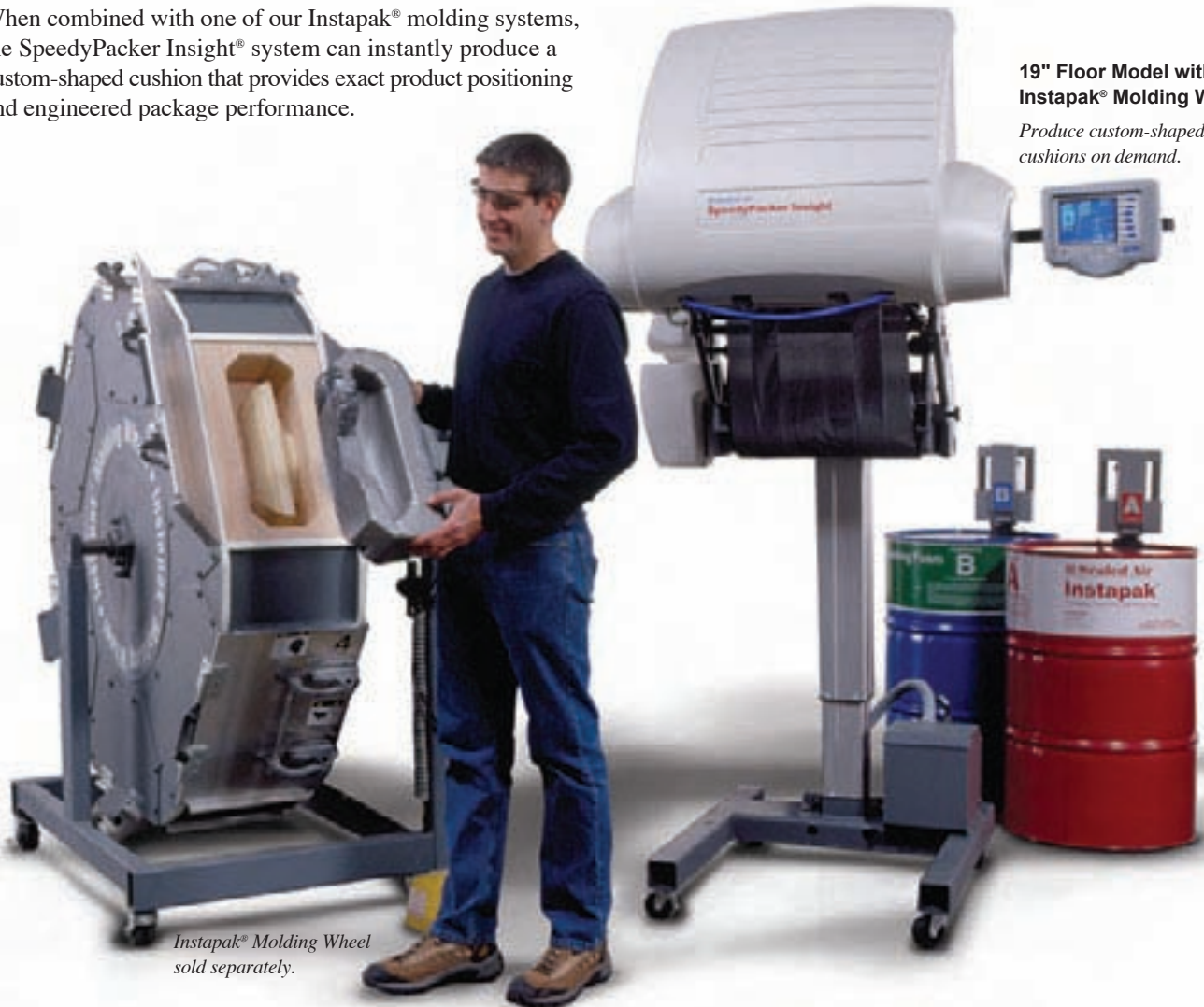
Instapak® Molding Wheel sold separately.

Produce custom-shaped molded cushions on demand.