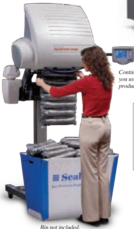
Bin not included.

Flexible Continuous Foam Tubes (CFTs) can be used to provide a base cushion or full wrap around. Insert blank film spaces between tubes to provide Instapak® protection only where needed.