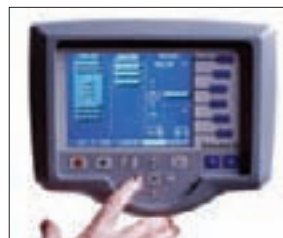
One Touch Operation

Full-color, user-friendly control panel.